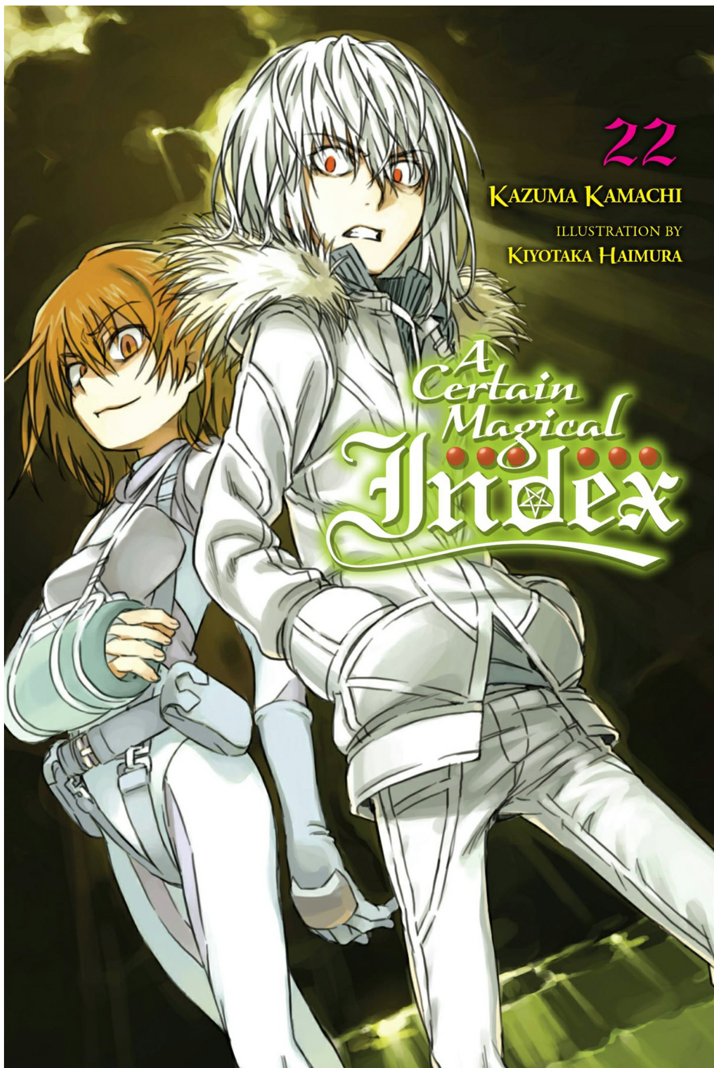
ILLUSTRATION BY KIYOTAKA HAIMURA